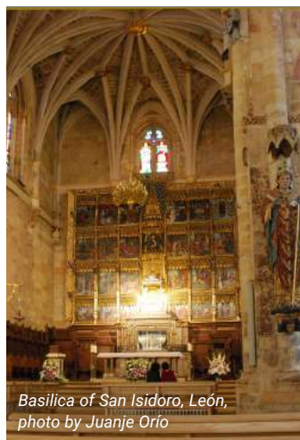
Basilica of San Isidoro, León

Included meals indicated each day as B/L/R/D = Breakfast/ Lunch/ Reception/Dinner.