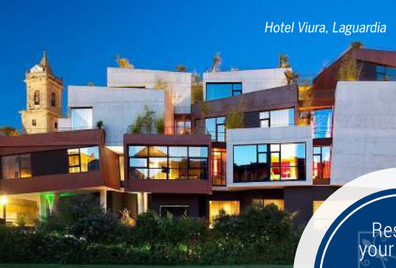
Hotel Viura, Laguardia