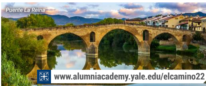
Puente La Reina

Approximate walking distance: 2.9 miles.