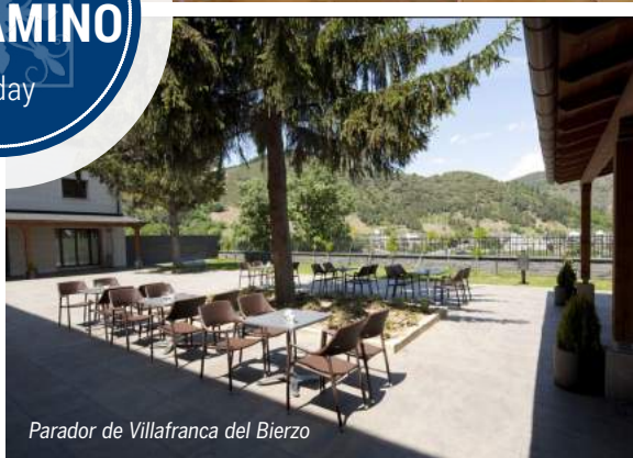
Parador de Villafranca del Bierzo