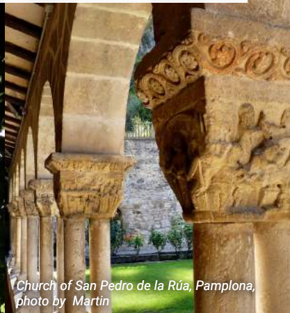
Church of San Pedro de la Rúa, Pamplona