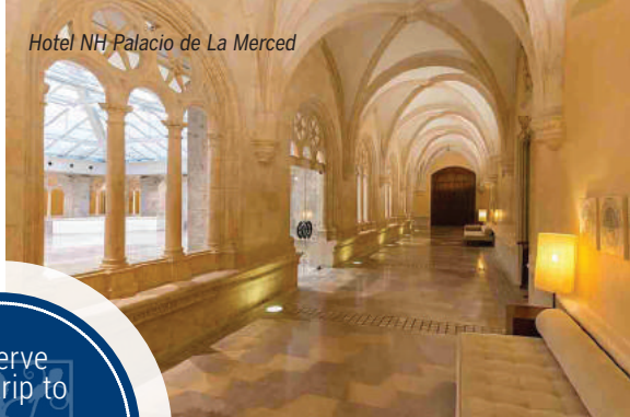
Hotel NH Palacio de La Merced