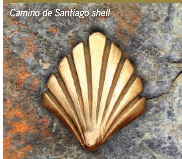
Camino de Santiago shell

NOTE: Itinerary subject to change. Some excursions in this program involve a significant amount of walking.