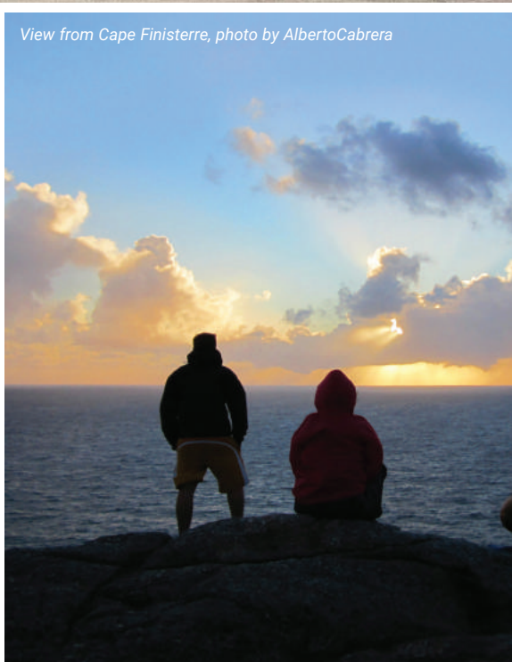
View from Cape Finisterre