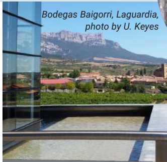
Bodegas Baigorri, Laguardia