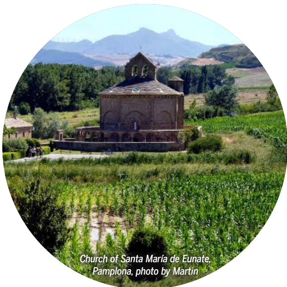
Church of Santa María de Eunate, Pamplona

“ Explore awe-inspiring cathedrals and monasteries in historic pilgrimage cities along the Camino, staying in splendid paradores. ”