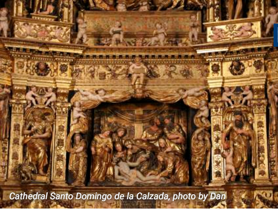
Cathedral Santo Domingo de la Calzada