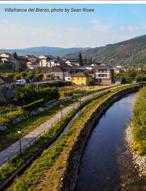
Villafranca del Bierzo