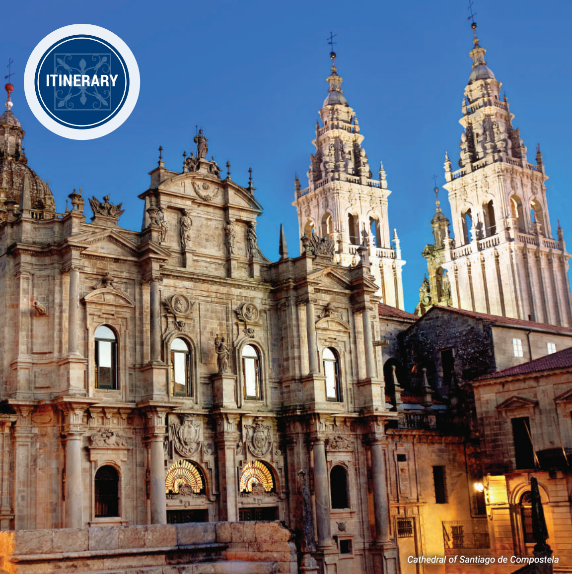
Cathedral of Santiago de Compostela