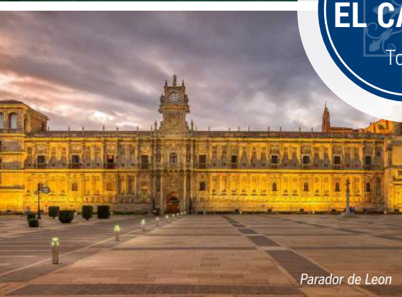
Parador de Leon